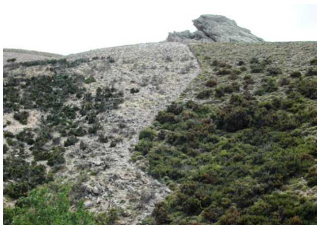
Fig. 3 Grazing land belonging to two farmers and subjected to grazing intensity

management practices and techniques for combating desertification. The proposed methodology provides a series of effective indicators that would help people to identify where land desertification is a current or potential problem, and which could be the actions to alleviate the problem over time. For the application the following steps must be followed: (a) choose the appropriate land use (agriculture, pasture, forest) (Table 4), (b) decide for the land degradation process or cause (water erosion, tillage erosion, soil salinization, etc.) for selecting the appropriate equation (Table 5), (c) define the data and the appropriate indices of the corresponding indicators (Table 2) and introduce to the equation, and (d) calculate the DRI. The derived methodology can be easily used through the expert system loaded in the DESIRE website available at: http://www.desire-his.eu/en/assessment-with-indicators/wp22-evaluation-a-short-list-of-indicators-thematicmenu-174/66-study-site-indicators . After defining desertification risk, the land user has the ability to change values of indicators related to land use and land management practice for establishing promising conservation strategies for reducing desertification risk at field or regional level. As described by Karavitis and others (this issue) a computer application has been developed that allows users to calculate desertification risk based on the equations that have been developed.