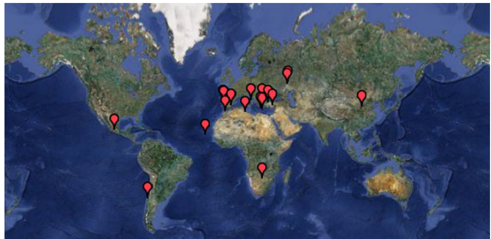
Fig. 1 Distribution of the investigated study sites

thematicmenu-173/160-manual-for-describing-land-degradation-indicators ).