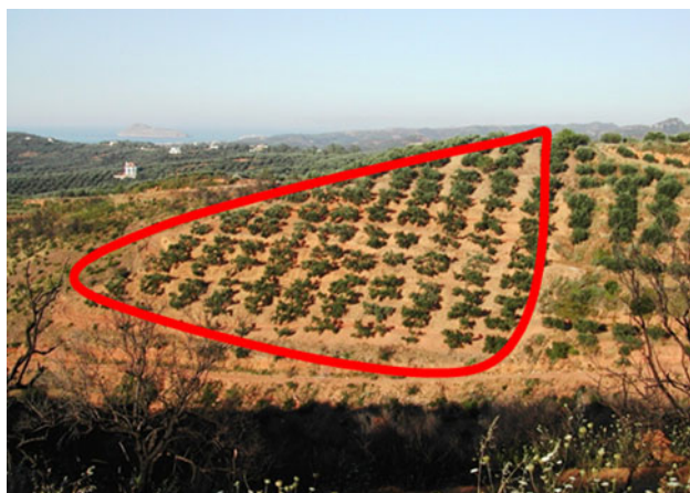
Fig. 2 Example of study field site (sampling point) with defined soil, topography, land use, and land management characteristics belonging to a certain farmer

number of candidate indicators used for the analysis in each process or cause ranged from 16 to 50. A forward stepwise multiple regression analysis was applied using desertification risk as the dependent variable and the candidate indicators assigned for each process as independent variables, using the following linear model (Steel and others 1997):